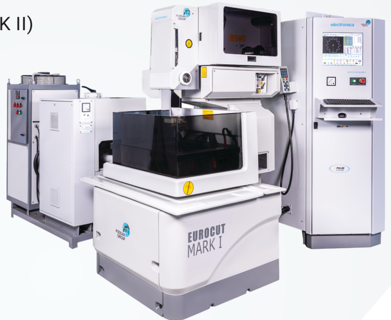
EURO CUT MARK I

Optimised features versatile applications