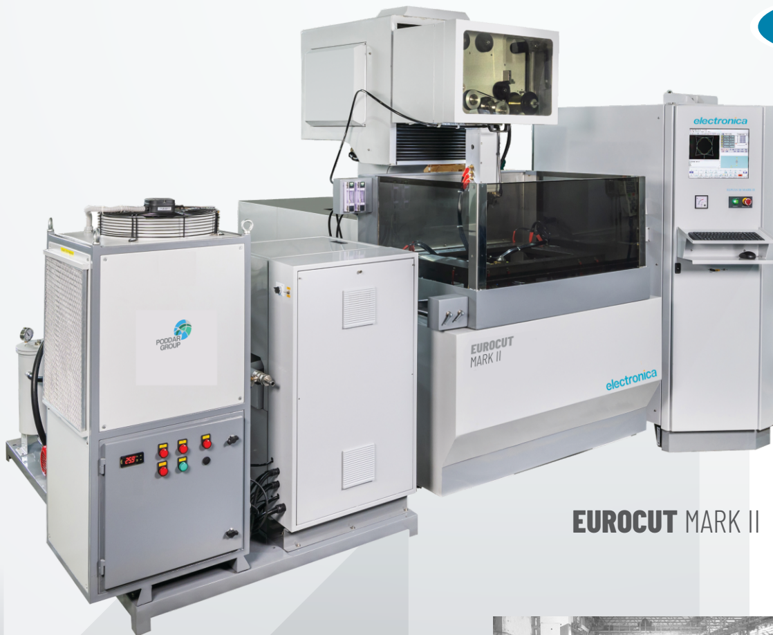
EURO CUT MARK II